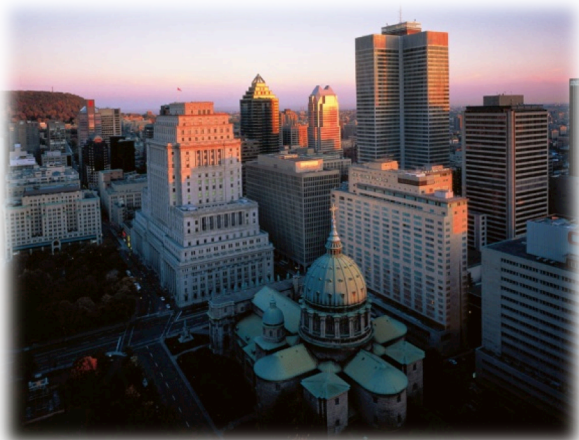
Aerial view of the Fairmont and Mary Queen of the World Cathedral