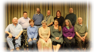
ELUNA Steering Committee 2014

The ELUNA Steering Committee has been working since the past ELUNA meeting on several key initiatives including the Ex Libris support migration to Salesforce; setting up collaborative working groups with IGeLU - focusing on Linked Data and Interoperability; and now extensive planning for ELUNA 2014! Upcoming work with Ex Libris and our partners in IGeLU will center on improvements to Salesforce and the Ex Libris Customer Center. Watch for the spring newsletter to learn more about these key initiatives, and plan on attending the ELUNA meeting to hear more in person.